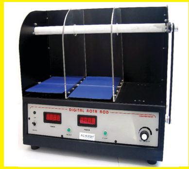
Rota Rod (Digital), 2 Compartment